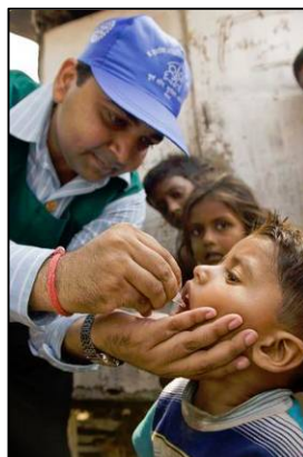
A child in Nepal receives a drop of oral polio vaccine.