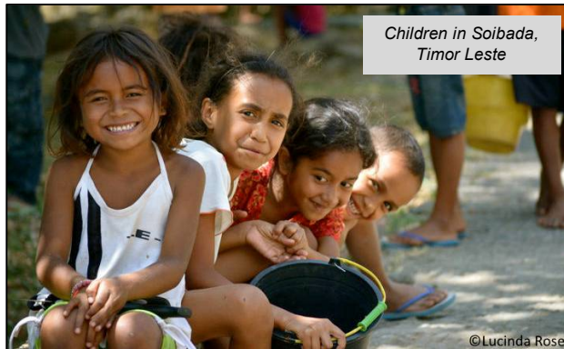
Children in Soibada, Timor Leste